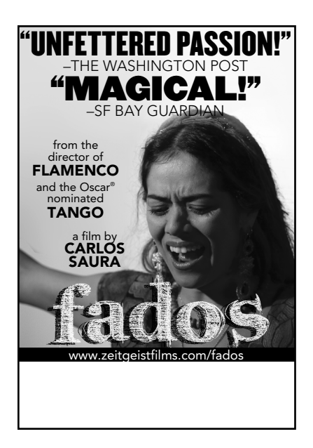
1 col x 3" = 3" S.A.U.