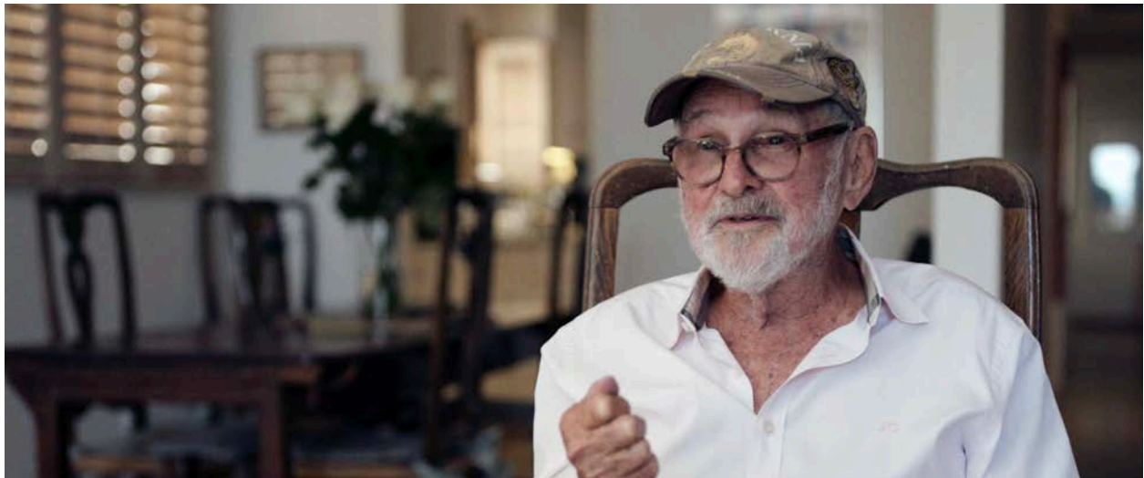
Director Norman Jewison, from an interview in FIDDLER'S JOURNEY, filmed at his Malibu home in 2016.