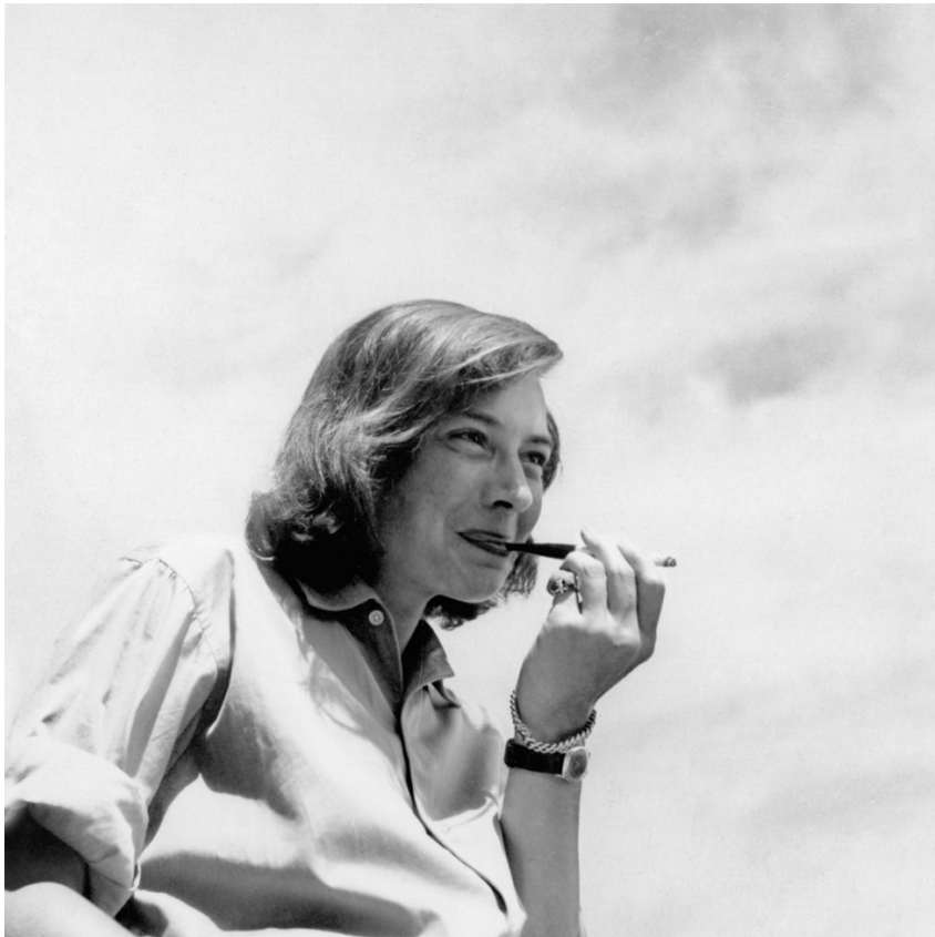
Patricia Highsmith

Excerpts from these notes voiced by Gwendoline Christie (Game of Thrones, Top of the Lake), beautifully interwoven with archive material of her and her most famous novel adaptations, create a vivid, touching portrait of one of the most fascinating female writers.