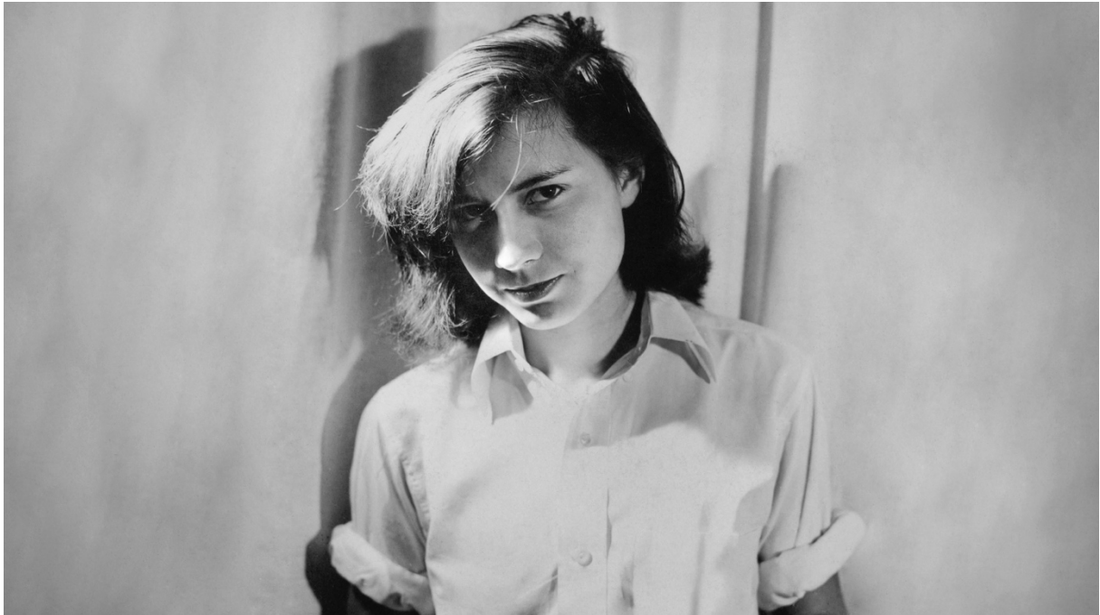
Patricia Highsmith, 1942, at 21