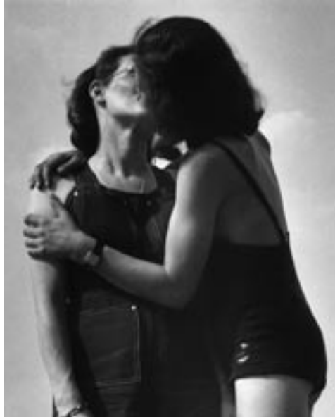
Felice Schragenheim and Lilly Wust, August 21st, 1944